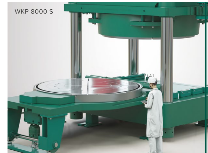
WKP 8000 S