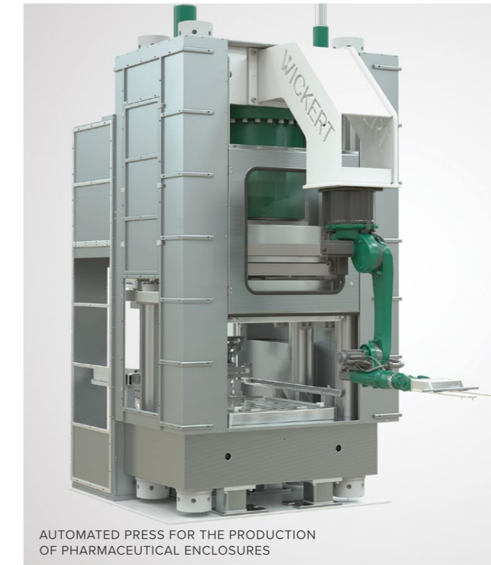
AUTOMATED PRESS FOR THE PRODUCTION OF PHARMACEUTICAL ENCLOSURES

➤ 5 YEAR WARRANTY ON ALL LOAD-BEARING PARTS